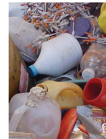
Loose needles in trash

All needles should be treated as if they carry a disease. That means that if someone gets stuck with a needle, they have to get expensive medical tests and worry about whether they have caught a harmful or deadly disease. Be sure you get rid of your used needles the safe way to avoid exposing other people to harm.