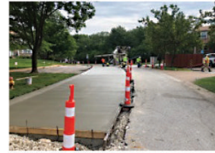
Carmel Woods During Construction

The City of Ellisville completed street improvements on Wolff Lane between Clayton Road and the dead end this summer. The improvements included removal of the existing street and replacement with a new 26' wide asphalt street with concrete curbs and gutters, installation of a new storm water system, removal and replacement of driveway approaches, utility relocation and other miscellaneous items such as grading and sodding. The City would like to thank the property owners on Wolff Lane who granted easements for the new storm sewer system.