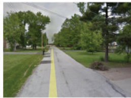
Wolff Lane Before Construction