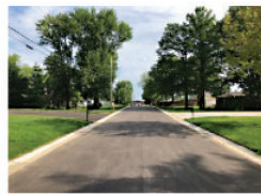
Wolff Lane After Construction

The City is currently completing street improvements on Carmel Woods Drive. This work includes complete concrete street removal and replacement. This work is expected to be completed this fall.