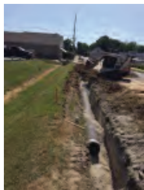
Installation of storm sewers

miscellaneous items such as grading and sodding.