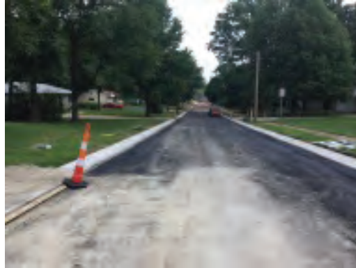
Installation of concrete curbs and asphalt base

The City of Ellisville recently completed Phase 2 of the street improvements on Froesel Drive between Ellisville Elementary School and Clarkson Road. Phase 1, Hutchinson Road to Ellisville Elementary School, was completed in 2017. Street improvements included removal of the existing street and replacement with a new 26' wide asphalt street with concrete curbs and gutters, construction of a new storm sewer system, installation of bio swales with amendable soils, removal and replacement of driveway approaches, new sidewalks and accessible ramps and other