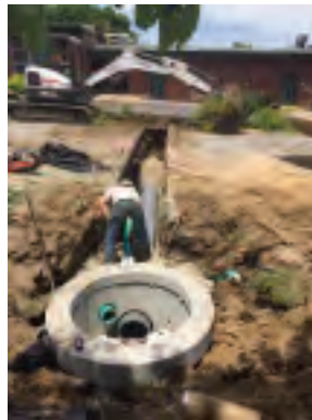
New storm water structures

removal and replacement of driveway approaches, utility relocation and other miscellaneous items such as grading and sodding. The project also includes installation of a new five (5') wide concrete sidewalk on the south side of Reinke Road along the new subdivision.